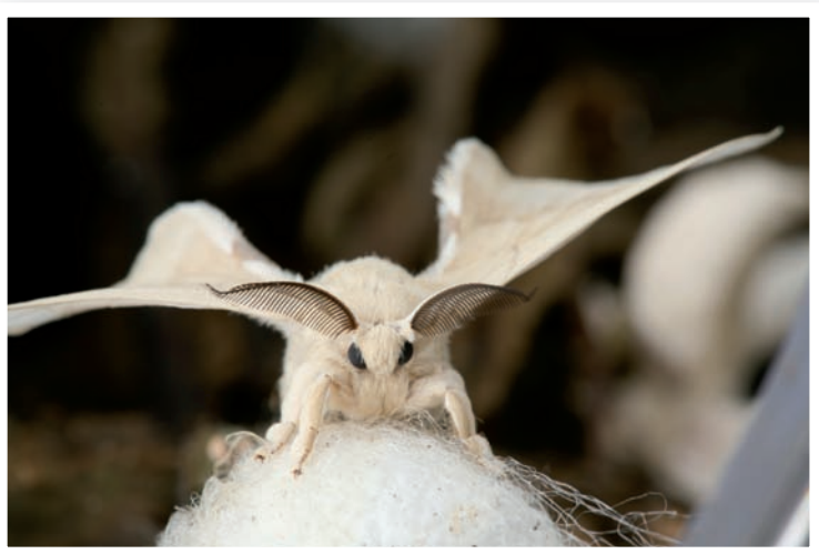
Silkworm Moth emerging from cocoon